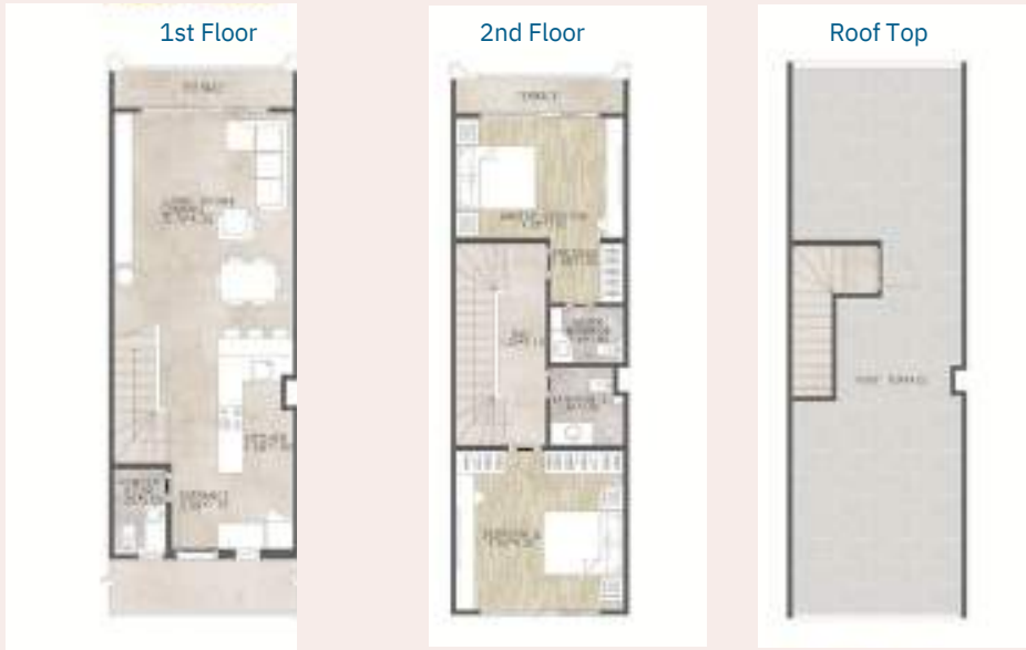
Total Net Area 115m2 +Roof 63 m2